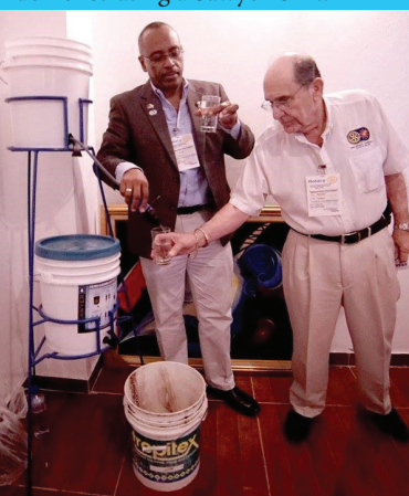
Rotary Haiti members demonstrating a Sawyer Unit.

PADF will manage CaribDA member donations that will be specifically earmarked for the purchase of Sawyer Units & 5 gallon buckets (manufactured in Haiti by PlasTech Industries in Haiti).